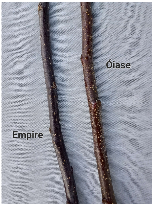
Apple: 'Óiase' (right) with reference variety 'Empire' (left)

and planted in 2018 in two side-by-side rows with a 1.8 metre spacing between trees within the row and 4.5 metre spacing between the rows. There were 15 trees each of the candidate and reference variety. Observations were taken from 10 trees, or 10 parts of trees, of each the candidate and reference variety.