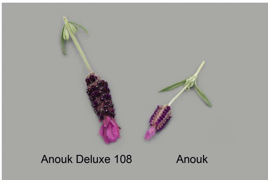
Lavender: 'Anouk Deluxe 108' (left) with reference variety 'Anouk' (right)