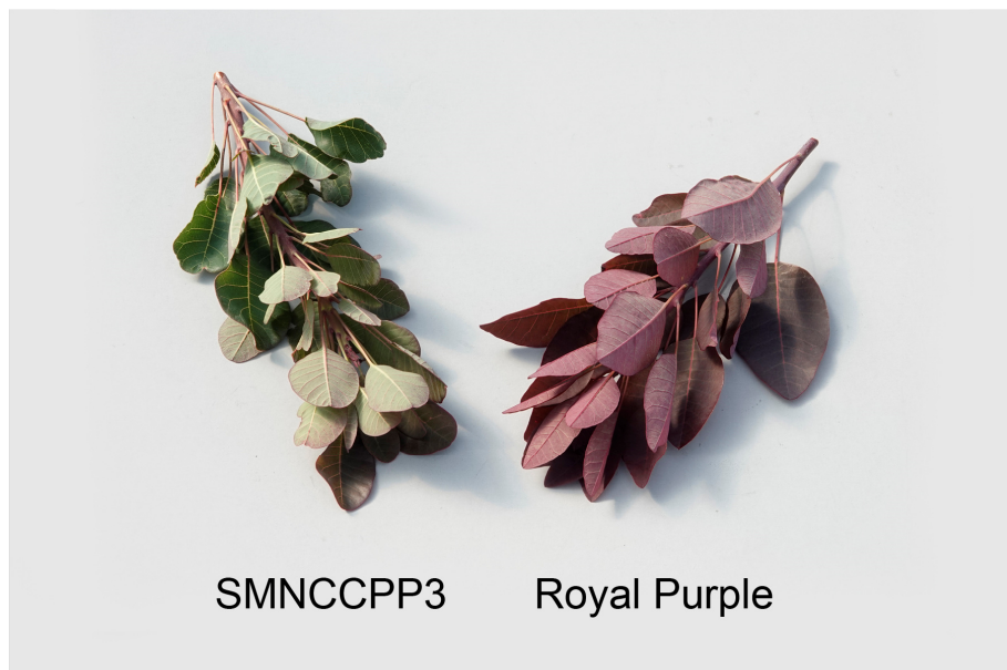
Smokebush: 'SMNCCPP3' (left) with reference variety 'Royal Purple' (right)